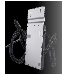
INVERTER TYPE Hoymiles