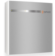
STORAGE BATTERY 0x Enphase Encharge 10kWh